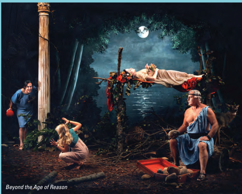
Beyond the Age of Reason

JDC Fine Art revives its public exhibitions with Lat-lárrj , a group show spotlighting four artists who've hit turning points in their careers—